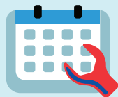
BATCH AND ISPF ACS TESTING, TRACING, & DEBUGGING

SMS/Debug and Audit provides unique storage management subsystem facilities, such as: