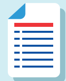
DADSM EXIT TRACING