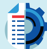
SMS CONFIGURATION & RECORDING