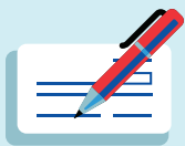
ACS ROUTINE TRACING