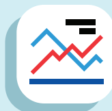
SMS CONSTRUCT USAGE REPORTS