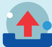
VOLUME SELECTION TRACING